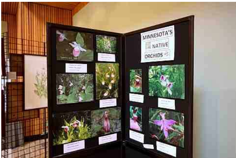
Display of Minnesota's Native Orchids at the Illinois Orchid Society spring show.

A recovery story about Platanthera leucophaea , the Eastern Prairie Fringed Orchid.