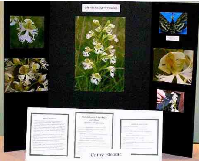
Cathy Bloome's display "Orchid Recovery Project"

The Illinois Orchid Society 2011 spring show focused on orchid conservation in "Wild Orchids: A Vanishing World"